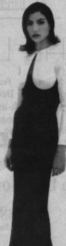
Can't you see yourself in this one?