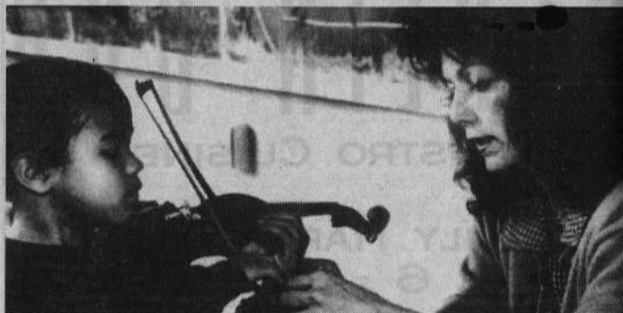
Left: "Make Room For Mario"

Above: "Fiddlefest", which won "Best Documentary" at the Chicago International Film Festival and was also nominated for an Academy Award.